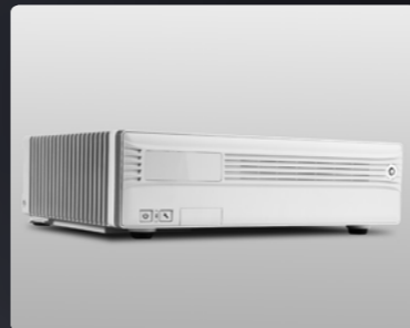
White chassis with silver trim also available