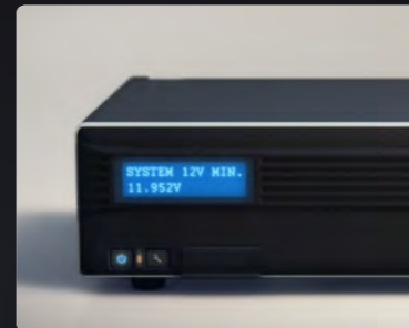
The optional LCM displays the current system status.