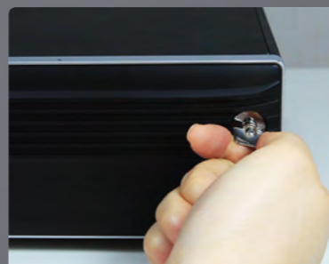
Components and storage devices can be locked to ensure data security.