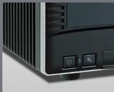
Power button, hard disk indicator and smart management connection button is located in the front of BP-500.