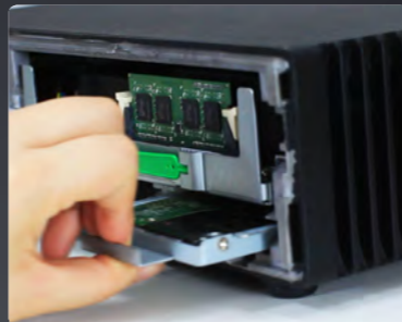
Hard disk is cableless and designed with a integration bracket for simple service