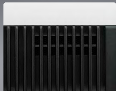
BP-500 utilizes a smart fan and multiple fin design to disperse heat ensuring higher reliability.