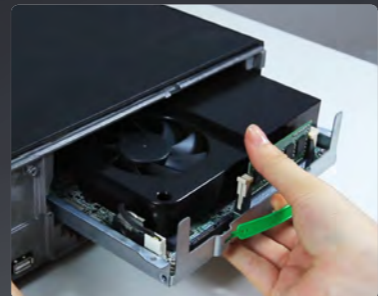
Main computing module is designed to be extractable for efficient upgrades and maintenance.